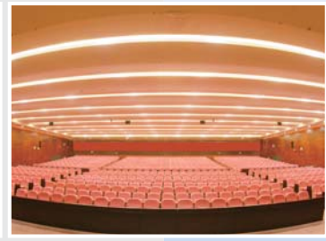
Arenas/Indoor sports facilities